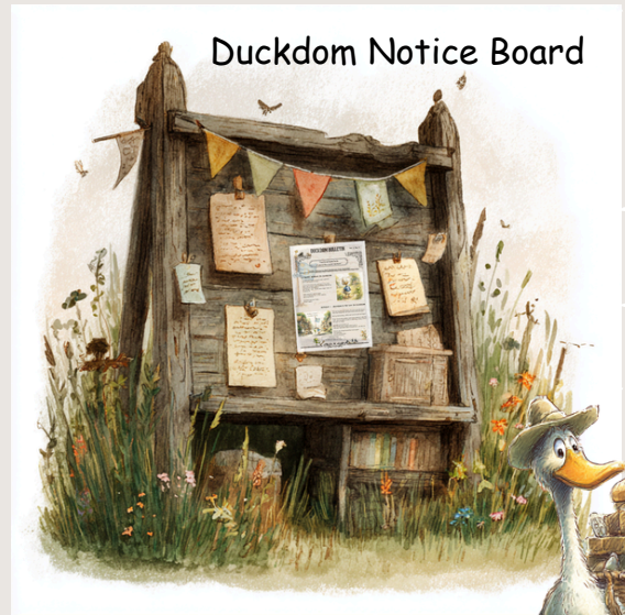
Duckdom Notice Board

If you're passing by... you may want to stop and take a look.